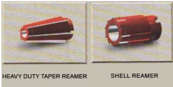
Heavy Duty Taper Reamer Shell Reamer