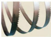
BIMETAL BANDSAW BLADE & CARBIDE TIPPED BANDSAW