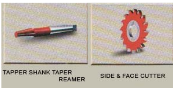
Tapper Shank Taper Reamer Side & Face Cutter