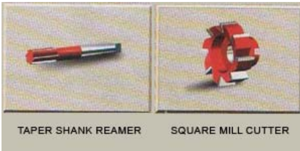
Taper Shank Reamer