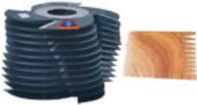
FINGER- JOIN CUTTER