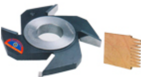
FINGER SHOULDER CUTTER