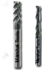
SOLID CARBIDE CNC ROUTER BIT