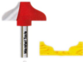
ROMAN OGEE DESIGN BITS