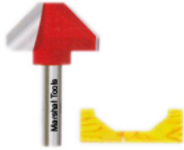
BOTTOM FLATE DESIGN BITS