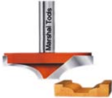
CNC ROUTER BITS