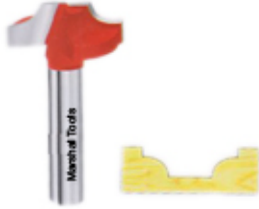
BEADING GROOVE BITS