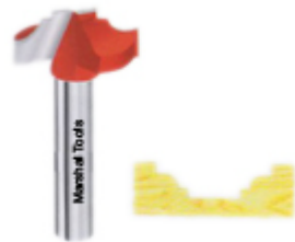
PLUNG OGEE DESIGN