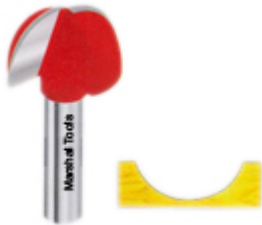
ROUND NOSE DESIGN BITS