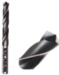
SOLID CARBIDE DRILL BIT