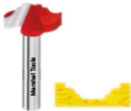
CLASSICAL COVE DESIGN BITS